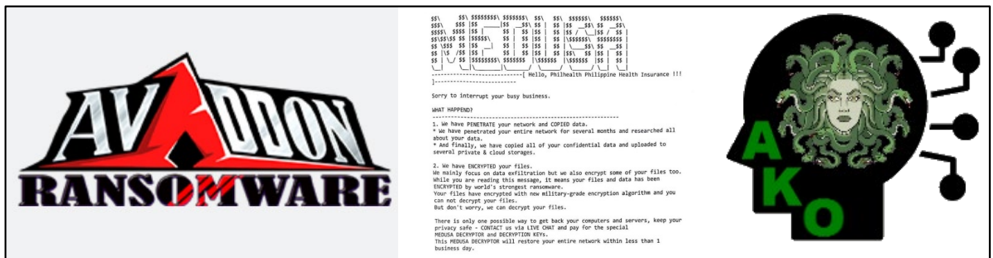
Figure 4: Logos for Avaddon, MedusaLocker, and Ako Ransomware Groups

Ako, also known as MedusaReborn, is ransomware that was initially observed around January 2020. Ako operations continued to be active during 2020, and their last publicly exposed victim was added to their shaming blog in July 2020. Mandiant determined that Ako ransomware shares numerous similarities with MedusaLocker and considers Ako to be a variant of MedusaLocker. See previous HC3 Analyst Note on MedusaLocker for additional analysis on this Russian-speaking group.