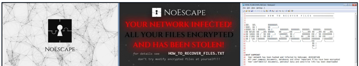
Figure 1: NoEscape Logo, Desktop Wallpaper, and Ransom Note.

At its most basic form, NoEscape is a ransomware, which is a malicious software that encrypts files on a victim’s computer and demands a ransom in exchange for the decryption key. It typically infiltrates a system either as a file dropped by other malware, or as a file unknowingly downloaded by users while visiting suspicious websites. It also distinguishes itself as a RaaS group, a type of ransomware that is offered as a service to other criminals who act as affiliates or customers.