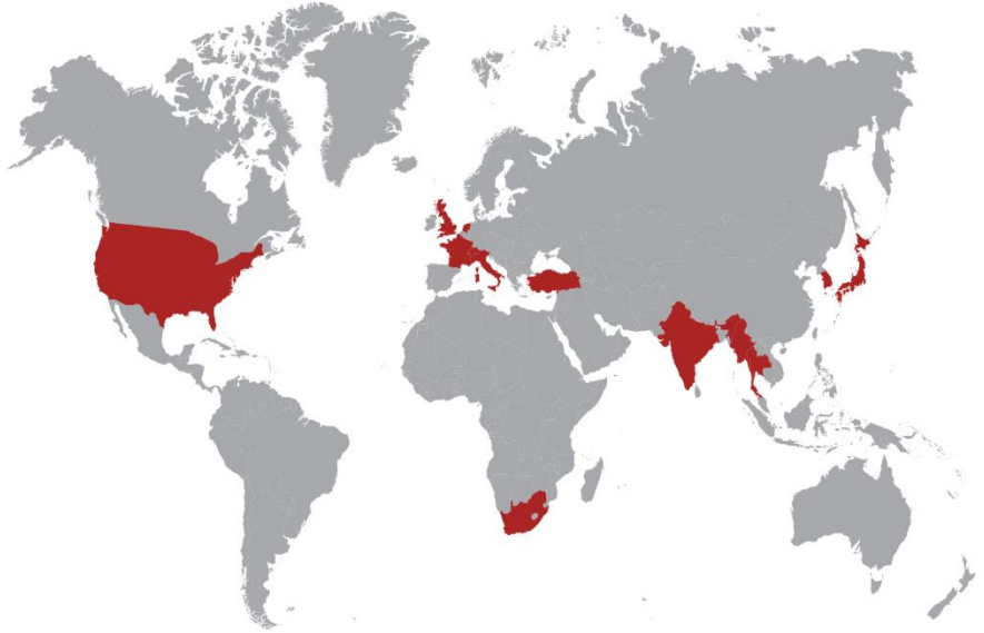
Figure 1: APT41 geographic targeting according to 2022 Mandiant data.

Thailand, Mongolia, Indonesia, Vietnam, Bangladesh, Ireland, and Brunei. The group's espionage campaigns have targeted healthcare (including pharmaceuticals), telecommunications, software and the high-tech sector, media/news, retail, travel, hospitality, sports, education, logistics, finance, entertainment (especially video games) and digital currencies. They are also known to target state governments , which can include healthcare organizations. Much of their targeting has historically included theft of intellectual property, and generally has been observed to align with China's most recent 5-year plan . Their