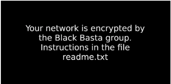
Figure 1: Sample Black Basta Ransomware Note. (Trend Micro Incorporated - Ransomware Spotlight: Black Basta)

Having already attacked several health and public health sector organizations in 2022, Black Basta is a credible threat to the sector. In its first year alone, the group exclusively targeted U.S.-based organizations, seeking to purchase network access credentials for companies specifically located there. In these attacks, Black Basta not only affected the websites of specific health information technology, healthcare industry services, laboratory and pharmaceutical, and health plans organizations across multiple states, but also cumulatively stole several gigabytes of data on personal identifiable information (PII) for members of health organizations, their customers, and employees. Continued and future attacks on and unpatched critical vulnerabilities in the public health and healthcare systems sector could be potentially life threatening, the impact of which would be devastating to critical infrastructure.